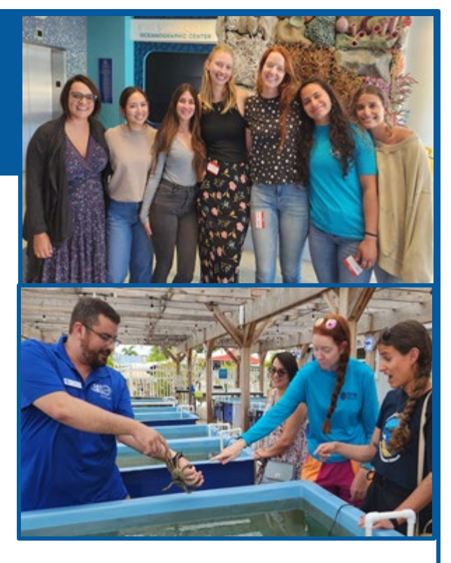
Fellows (above) at the Guy Harvey Oceanographic Center and at the Mote Marine Lab (below)

This also gave the Fellows important opportunities to reconnect with each other and discuss crossjurisdictional challenges and successes.